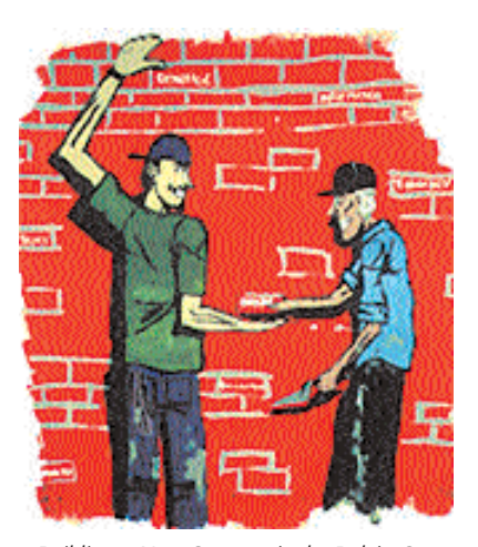
Building a New Community by Delvia Cortez

We may be one of the poorest parts of the country, but we're rich in stories.