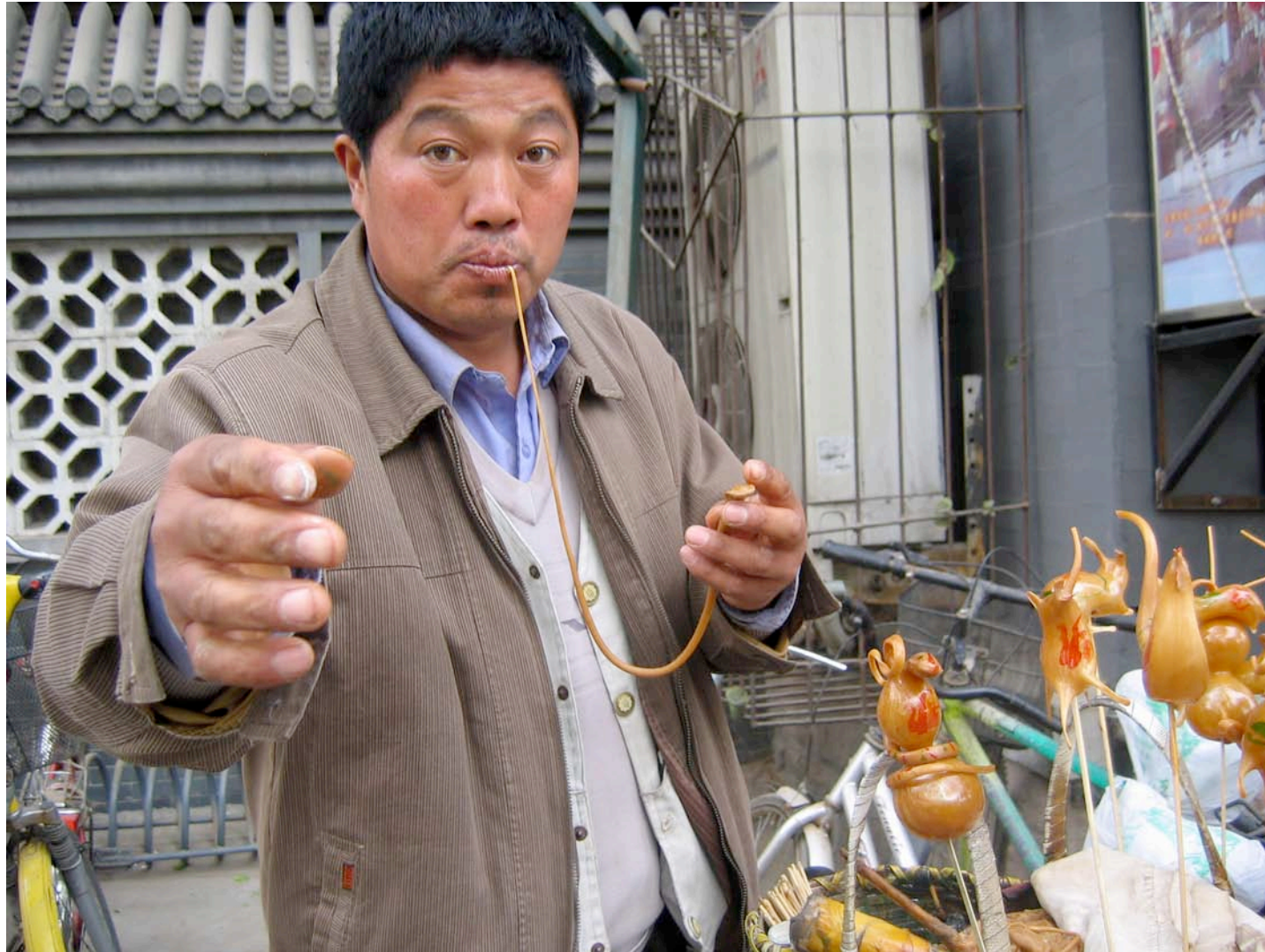
Taffy Blower by students at Beijing High School No. 12, Beijing, China

This man, on a tourist street near Houhai Lake, hopes to attract customers with taffy animals on sticks. He blows and shapes the animals right before your eyes. Like all street vendors in Beijing, he asks for the highest price and then expects customers to bargain him down.